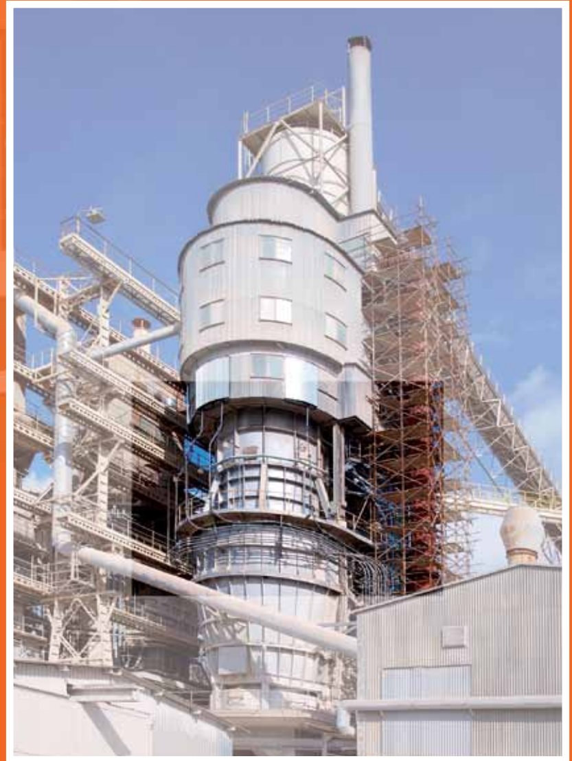
General view of the kiln Maerz